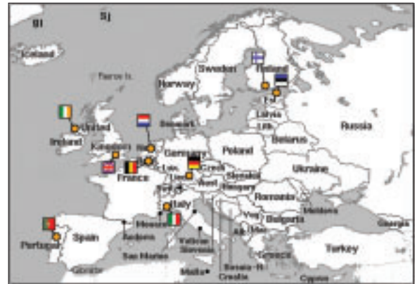
Figure 2: The Sixxs Internet Points of Presence (POPs) in Europe.

Registries charge a lot of money for IP addresses. In environments of all sizes – from tiny home networks to massive enterprise networks – users have moved to Network Address Translation (called NAT) to avoid the expense of buying IP addresses that may not be used, even though NAT can cause various