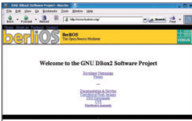
Figure 1: Tuxbox provides a Linux distro for the DBox2.

Sixxs uses a rating system to manage quality of service. You get 25 credits for registering. 25 credits will get you an IPv6 tunnel with a single IP address (in